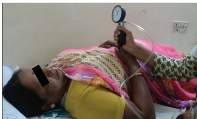
Figure 1: Measuring cervical flexor endurance

In sitting position, subject performed an isometric push against the hand to strengthen the neck. Subject was told to hold the left palm against the left side of the head. Push the left hand against the head while also pushing your head toward your left hand at about half strength. Hold for 30 s. The same was repeated with the right hand on the right side of the head and using either hand, with the back of the head, and the forehead. This was repeated 5 times.