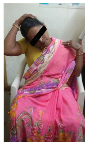
Figure 2: Stretching exercise-Home exercise protocol