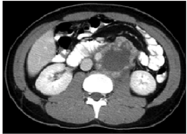
Figure 3: Abdominal computed tomography scan showing a large retroperitoneal mass on the left side of the aorta with central necrotic component