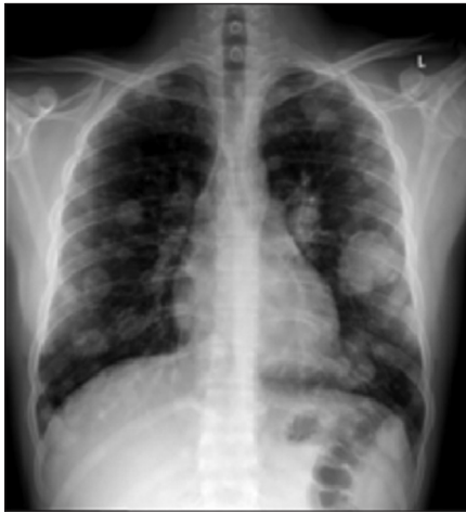
Figure 1: Chest X-ray showing bilateral, multiple, variable size, pulmonary nodules